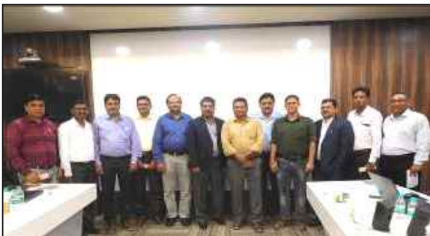
Best group Awarded with token of Appreciation

After visiting sites, group coordinators presented on the best practices observed & areas for improvement. All the high-risk observations were attended on priority & closed within stipulated time frame. Value added observations were appreciated and the best three groups were rewarded.