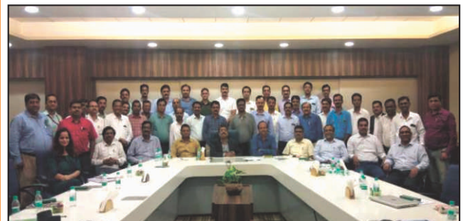
Group photo - MD's EHS Workshop at Mumbai