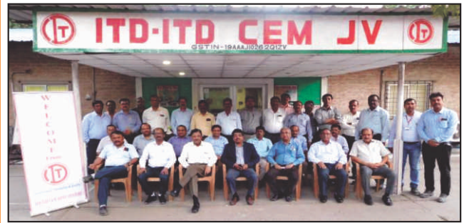
Group photo - MD's EHS Workshop at Kolkata