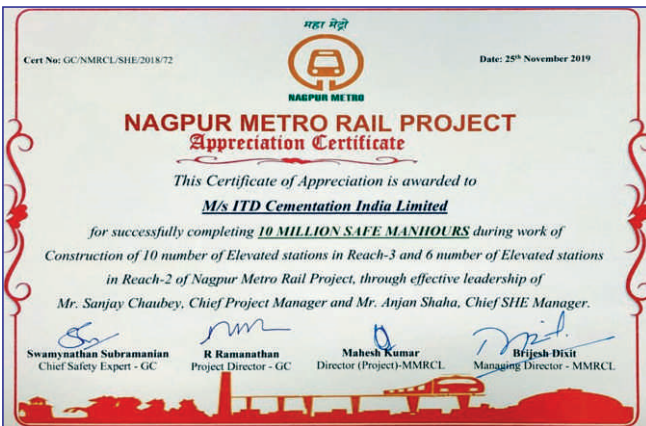
Div.5 NMRC Nagpur Metro Stn. Bldg. (41116 EW) R-3 & 2 - Received Certificate from Client for Achievement of Ten Million Safe Man Hours