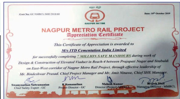
Div.5 Nagpur Metro Viaduct (42817 EW) (44617 EW) R-4 - Received Certificate from Client for Achievement of Seven Million Safe Man Hours