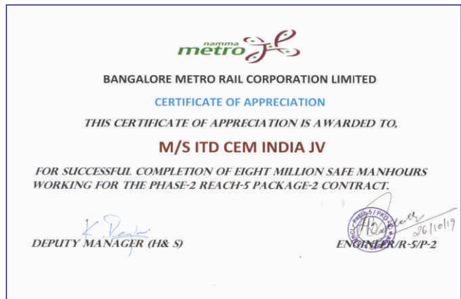
Div.2 BMRCL, Reach 5-P-2 (A1917 BW / D2) - Received Certificate from Client for Achievement of Eight Million Safe Man Hours