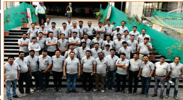
NMRCL Nagpur Metro Reach-3 & 2 Project Team showcasing team work for achieving safety milestone by wearing company's Safety T-shirts