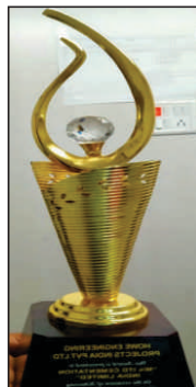
Div.4 Dhamra (LNG), HOWE Odisha (DM-046318) Received Trophy from Client for achieving One Million Safe Man Hours.