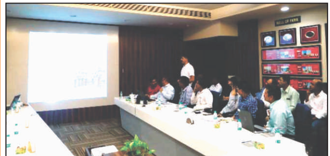
Group Coordinator Presenting observations at Mumbai