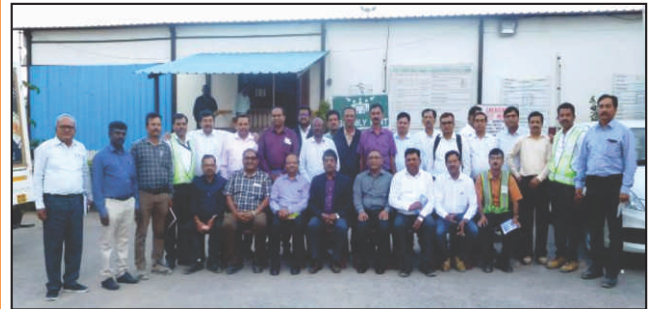
Group photo - MD's EHS Workshop at Bangalore