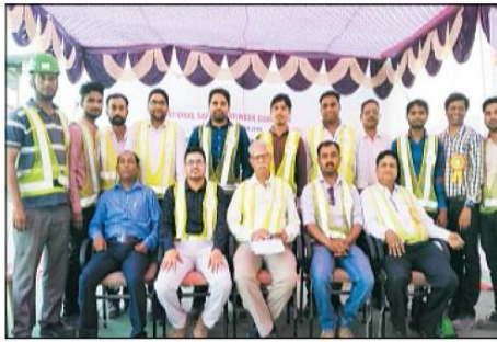
MMRCL officials and employees take part in the seminar.

AMMRCL officials are training employees at Little Wood Safety