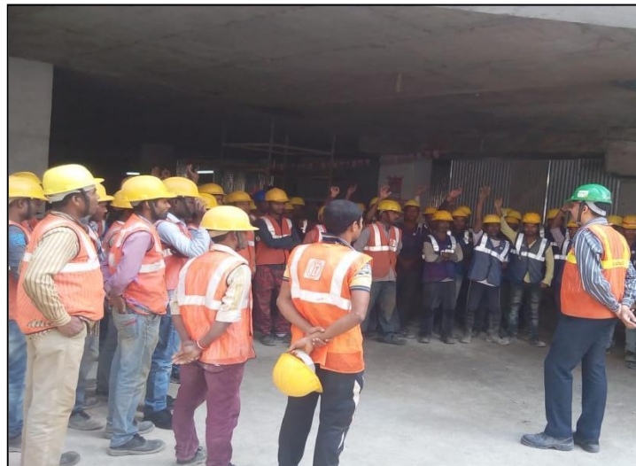
Training on "Work at Height" by EHS Staff at UG 2, KMRCL (A0610 AT), West Bengal