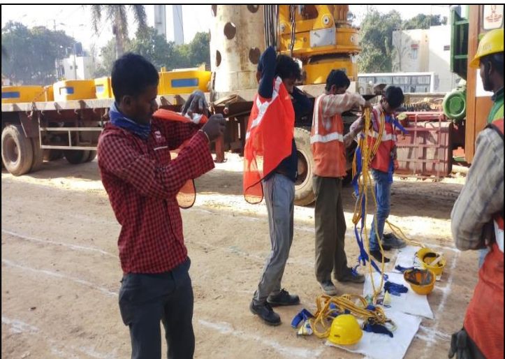
PPE's Race Organized for Workers at R1A- BMRCL, (A1617 BW / D3), Karnataka