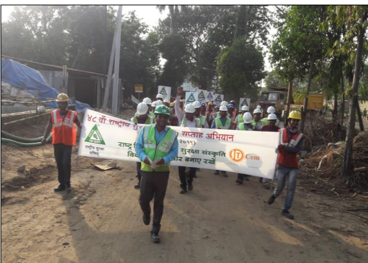
Safety March during NSD Celebration at OR I & OR II Site, (42917 DM), Vizag