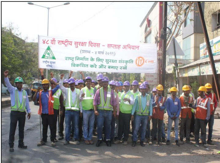
Rally with Banner for Safety Awareness to Public at NMRCL, Piling, (43417 CF & 44917 CF), Maharashtra