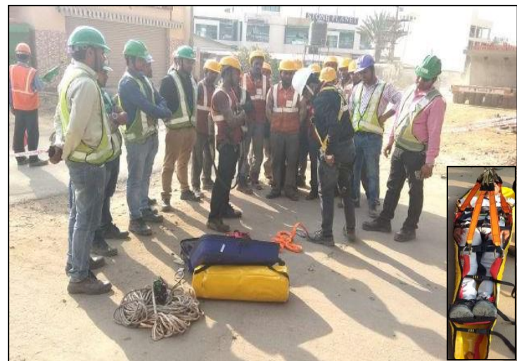
Training on "Emergency Rescue of Person from Height" by M/s Honeywell at R5 P2- BMRL, (A1917 BW / D2), Karnataka