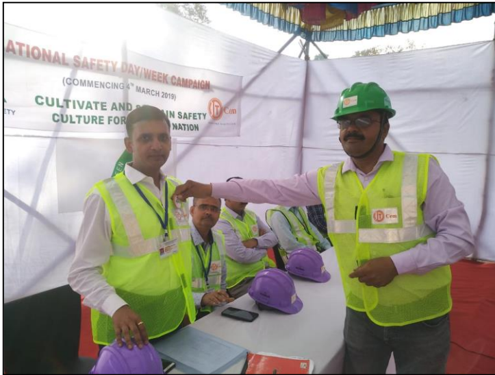
Pinning of Safety Badge to MMRDA representative during National Safety Day at Track Works Mumbai, (046218 BK)