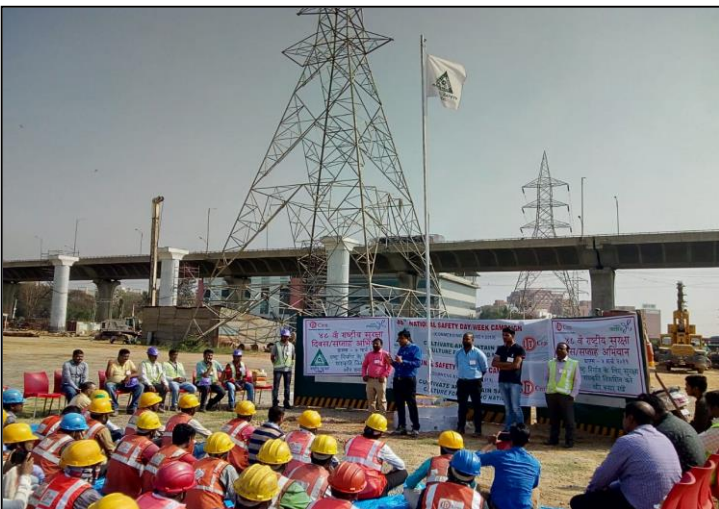
Safety Speech by Project Manager at R5 P1-BMRCL, (A1817 BW / D3), Karnataka