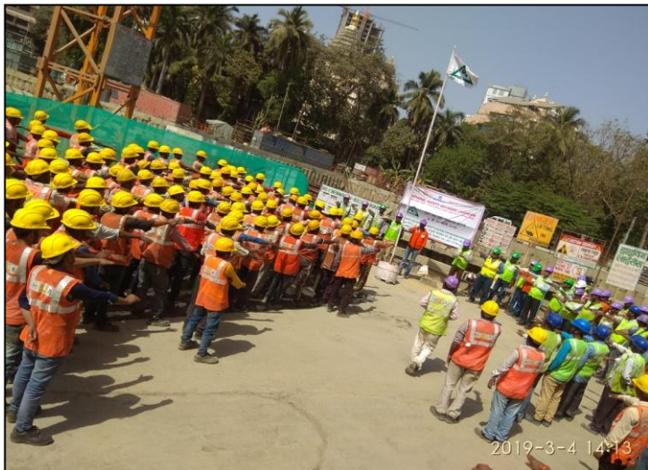
Safety Pledge by Project Team of Mumbai Metro MMRC (A1316 AT), Maharashtra