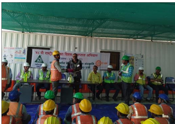
Prize Distribution Ceremony at LNG Jetty Site, Dhamra (DM 046318), Odisha