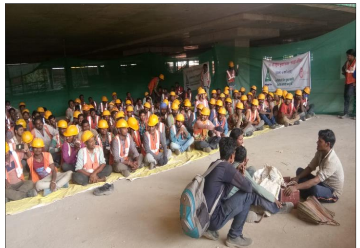
Nukkad Natak by Workers at Nagpur Metro, Station Building Reach 2-3 (41116 EW), Maharashtra