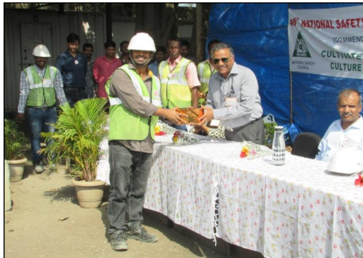
Prize Distribution Ceremony at J5 Oil Berth Site, MbPT, (39016 DM), Maharashtra