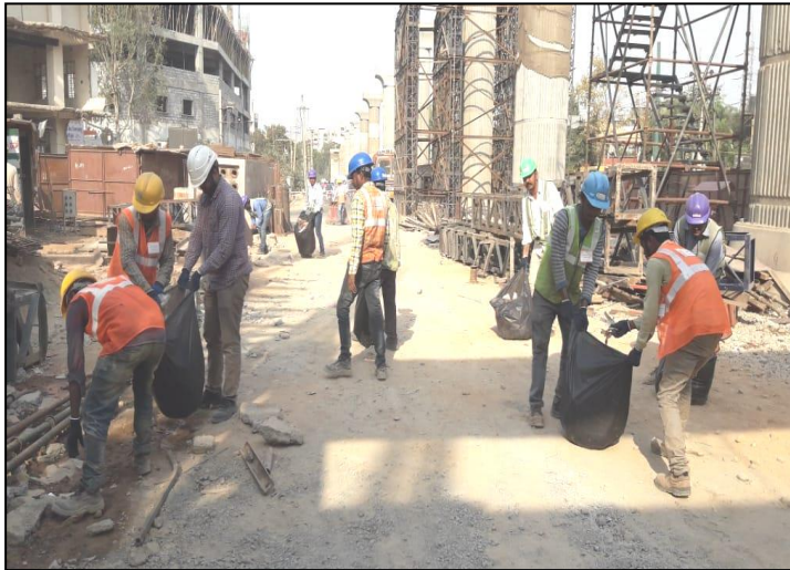
Mass Housekeeping Drive at R1A- BMRL, (A1617 BW / D2), Karnataka