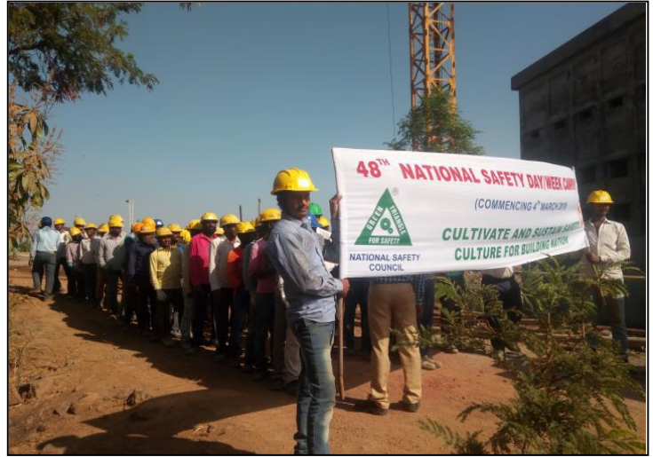
Safety March at BHAMA Water Supply Scheme (35715 BS), Maharashtra