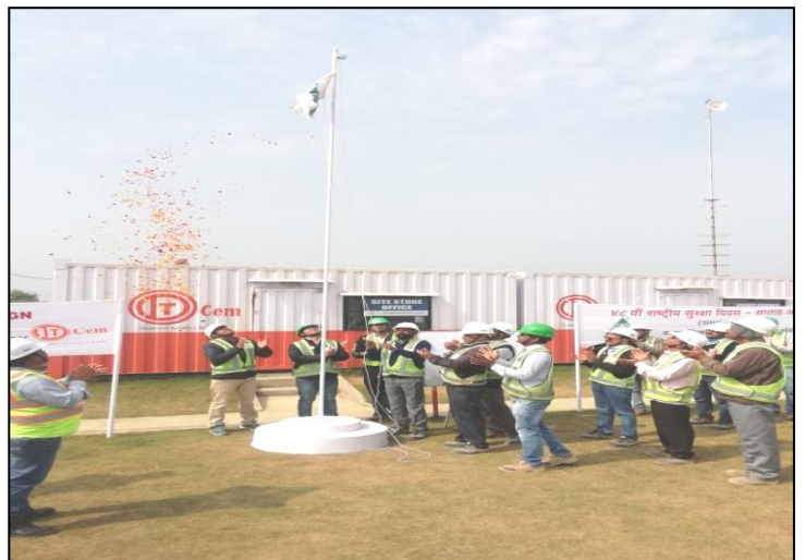
Flag Hoisting on the Occasion of National Safety Day at NPCIL, Gorakhpur, (45318 CG), Uttar Pradesh