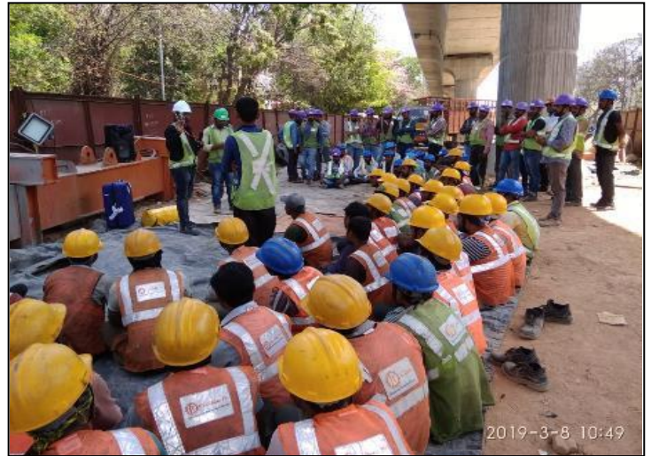
External Training on "Emergency Handling Procedure" by M/s Honeywell at R1B- BMRL (A1717 BW / D2), Karnataka