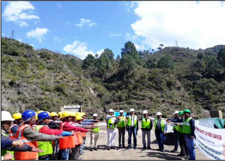
Safety Pledge by Staff & Workers at ADITS, RVNL (045918 AN), Uttarakhand