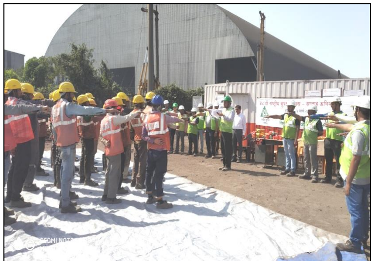
Safety Pledge by Project Team of Stone-Column, JSW Dolvi, Pen, (046618 CG), Maharashtra