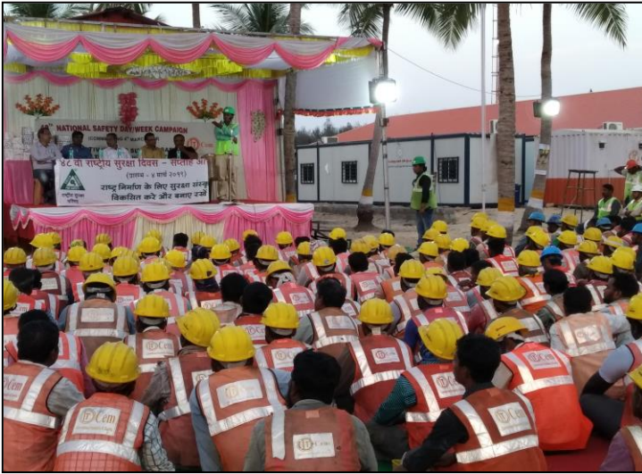
Safety Speech by EHS In-charge at Udangudi, TANGEDCO Site (45418 DM), Tamil Nadu