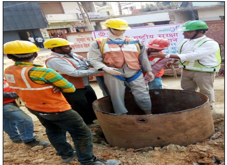
Training on "Rescue of Person from Pile Bore Hole" by EHS Staff at R5 P2-BMRCL, (A1917 BW / D3), Karnataka