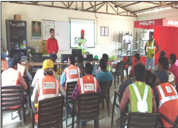
External Training Program on "Power Tools" by M/s HILTI at R5 P1- BMRL, (A1817 BW / D2), Karnataka