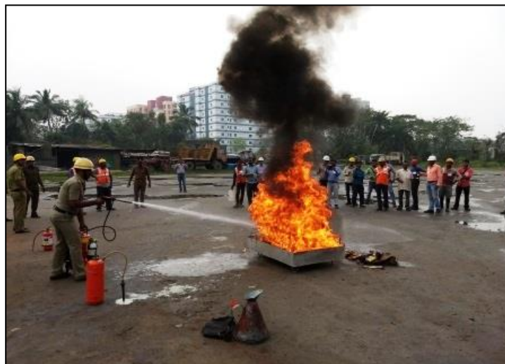
Demonstration on Use of Fire Extinguisher at Churial Canal, (A2118 AT), West Bengal