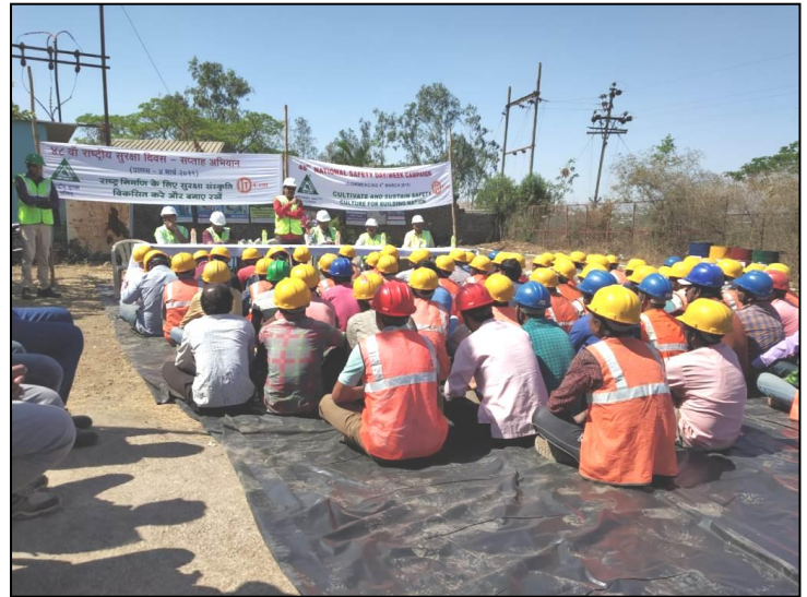
Safety Speech by PM during NSD Celebration at Roadwork's, REL Infra, (046518 BR), Pune, Maharashtra