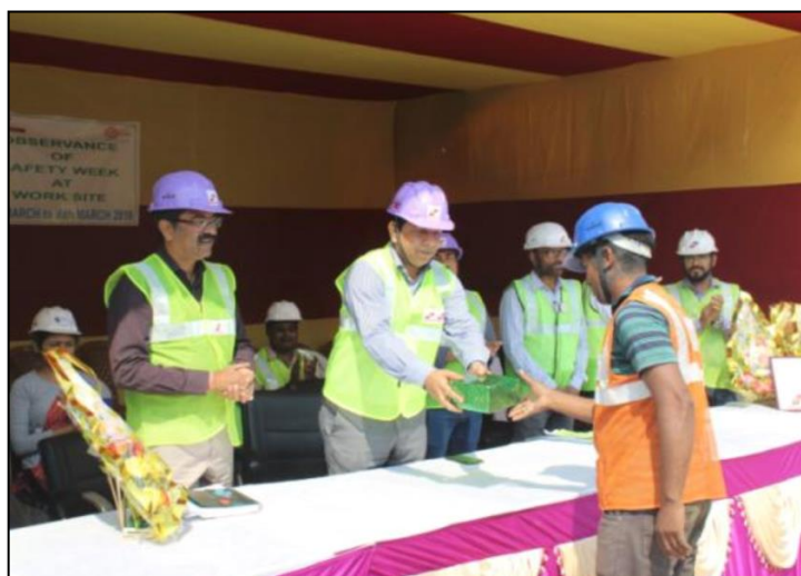
Prize Distribution Ceremony at KBB, Kolkata Metro Yard (44217 AW), West Bengal