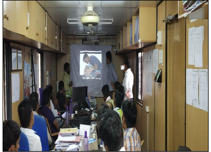
External Training on "Cardio Pulmonary Resuscitation" by Manipal Hospital at R1B- BMRCL, (A1717 BW / D3), Karnataka