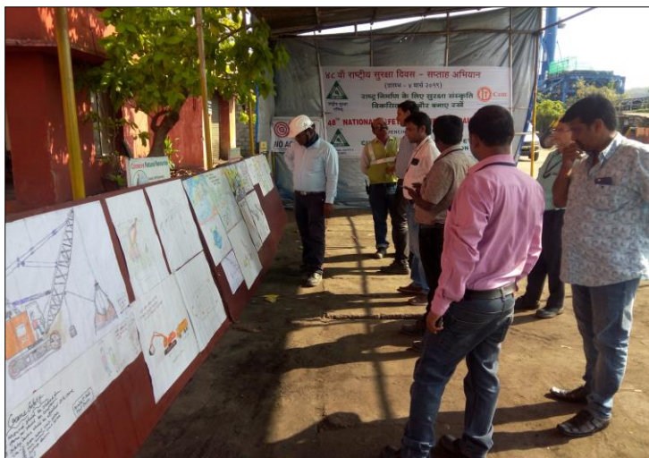
Safety Posters, Slogans, Poems, displayed during NSD Celebration at EQ-2 to EQ-5 Site, VPT (37515 DM), Vizag