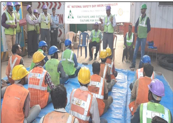
Safety Speech by Project Manager at Mumbai Metro, MML-3, Package 4, (41716 CF), Maharashtra