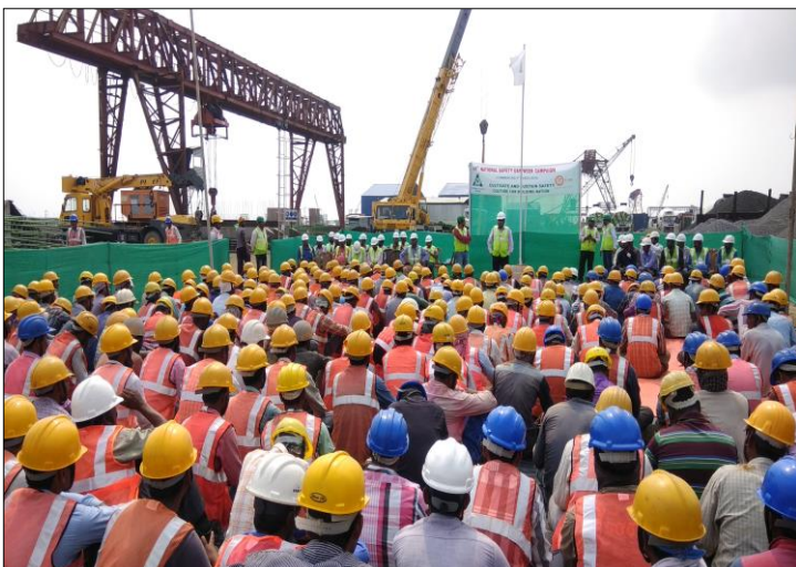
Safety Speech by Project Manager during NSD Celebration at IWAI, Haldia Site (42016 DM), West Bengal