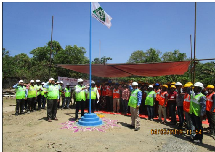
Flag Hoisting by Project Director at Refit Jetty Site, ALHW, Port Blair (DM 045818), Andaman