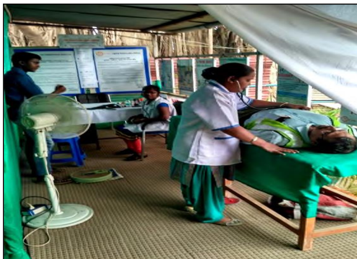
Health Check-up campaign for Staff & Workers at Shalimar Subways, Howrah (41616 AX), West Bengal