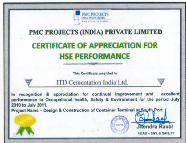
Appreciation Certificate received from PMC Projects

Safety is a state of mind, accidents are an absence of mind