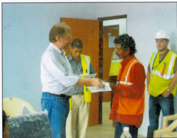
Safe Behaviour award received from Siemens